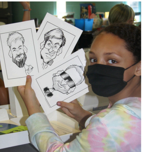
Youth Enrichment Program

Children and parents learned to calm their emotions, keep problems small and communicate their feeling for improved family relationships.