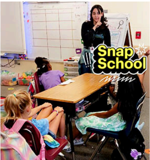
SNAP (Stop, Now And Plan)

Teens and young adults learned the skills to build self-confidence and develop healthy relationships.